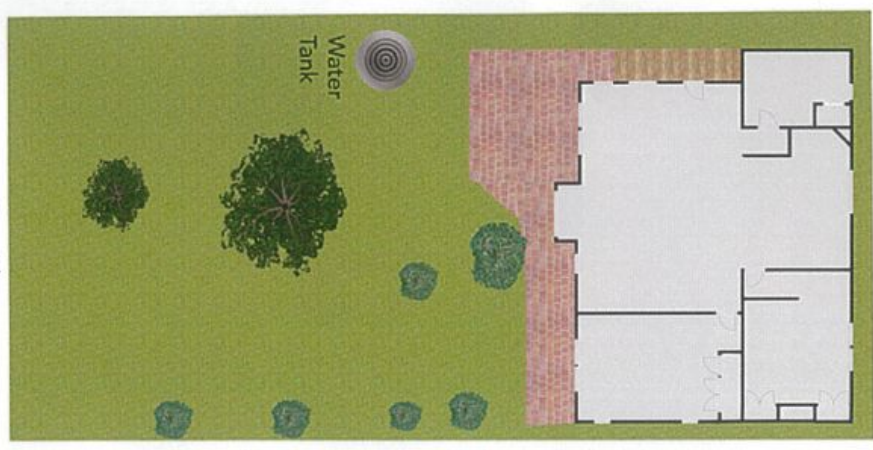
Site Plan (not to scale)