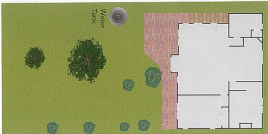
Site Plan (not to scale)