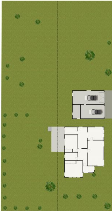
Site Plan (not to scale)